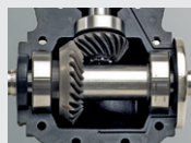
Composite drive legs