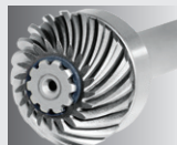
Case hardened spiro-conical gears