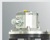
Branded hydraulic components