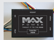
Unrivaled safety features